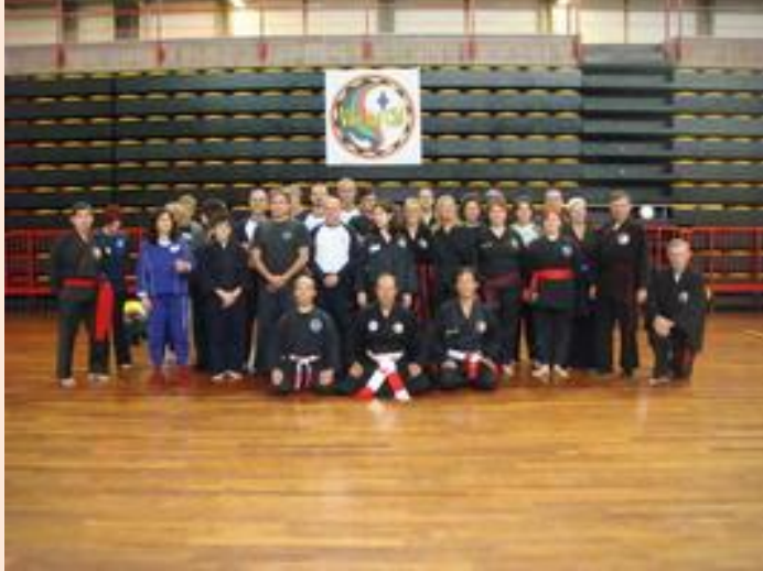
LA SPEZIA November 2007